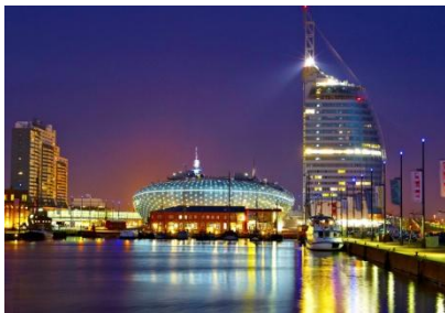
Night view