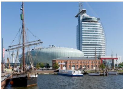
Exterior view daylight

The Klimahaus® Bremerhaven 8° Ost: The flowing shape of the 125m long and almost 30 m high building in Bremerhaven's new tourist quarter "Havenwelten" resembles a cloud or a stylised ship. This unique knowledge and adventure world is concerned with the highly topical issues of climate and climate change.