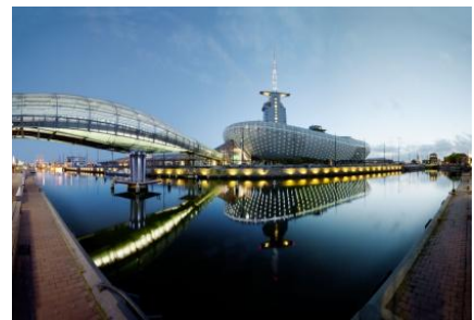
Exterior view twilight